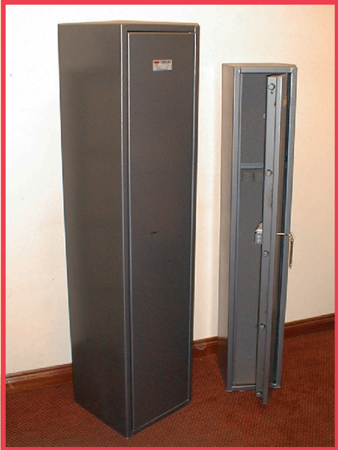
2 & 4 GUN CABINETS